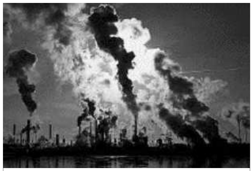
Capitalism is destroying the health of human beings and of the planet as a whole. Reversing these disastrous effects would be one of the major tasks under socialism.

a problem. Although every reputable scientific group today concedes the fact of global warming, the Bush administration claims that it is not yet proven and that more study is necessary. It is nearly certain that this global warming will result in the flooding of entire islands, elimination of vast areas where basic crops are