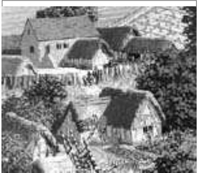
An Early Feudal "Manor", or Small Town Peasants were not allowed to move away and had little experience in life outside their manor.

For instance, under feudalism, the peasant ("serf") was tied to the land; he or she was forbidden to leave the land they worked. This was possible (and necessary) because they were not in the main producing goods to be sold on an ever changing